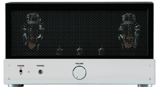
With the tube cover