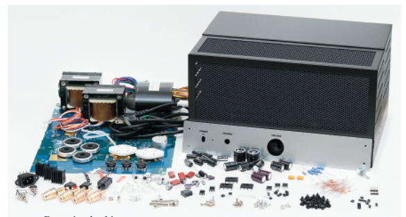
Parts in the kit